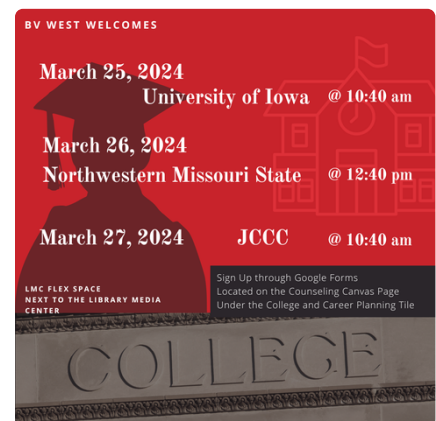
KC Area College Fair